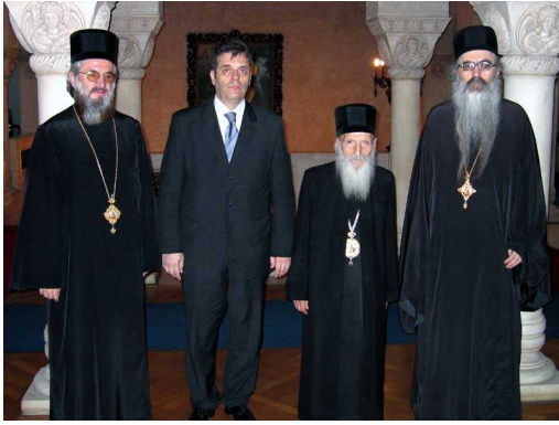
VOJISLAV KOSTUNICA (SECOND ON THE LEFT)

Speaking of Kosovo, DSS has re-activated itself in Serb enclaves. It openly stands in the way of cautious steps the Belgrade authorities have been making towards stabilization of Kosovo. In late June, staged rallies of Serb citizens in North Kosovo against EULEX were resumed (because of the establishment of customs authorities at border crossings with Serbia). According to available information 5 , DSS acts behind the scene, whereas Serbian Minister for Kosovo and Metohija Goran Bogdanovic and local officials of the Democratic Party distance themselves from those protests. DSS' latest return to Kosovo aims at dissuading the Serb population from casting a ballot in local elections called for November 15. Stones thrown at the automobiles taking Serbian ministers to Gracanica for the celebration of St. Vitus Day testify of such plan. The automobiles were stoned by members of the extreme rightist organization, the Belgrade-seated Serb National Movement 1389 (close to DSS) 6 and local Serb officials. 7