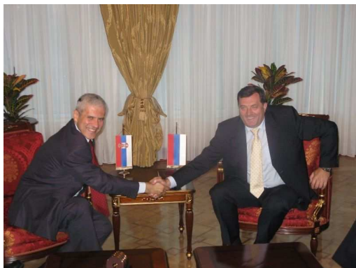
BORIS TADIC AND MILORAD DODIK

tences they had claimed for themselves as sole authority of Bosnia-Herzegovina.