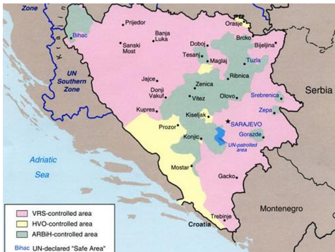
Bosnia Lines of Control and Safe Areas Late 1994

TOM BLANTON: Our working title for the session this afternoon is "Testing the Safe Areas." We intend to look at issues of close air support, the crises around Goražde and Bihać, and the pattern of threat, escalation, hostage-taking, and de-escalation which will take us right up to the July 1995 crisis in Srebrenica. After the coffee break we will look at the Dutch perspective, starting with the conversations with Boutros-Ghali in January 1994. What were the expectations? What were the promises? What were the commitments?